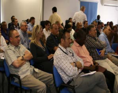
Attentive UNIFIL staff members

UNIFIL has come on board to join our world-wide SMART Development Team by taking on the challenge of creating the fourth module in the DPKO / DFS SMART programme: The Operational Support Module.