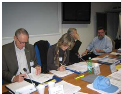
The SMART Observers/Mentors assessing the participation of the Learners during the Workshop

Day 4 consisted of a full day of simulations sur-